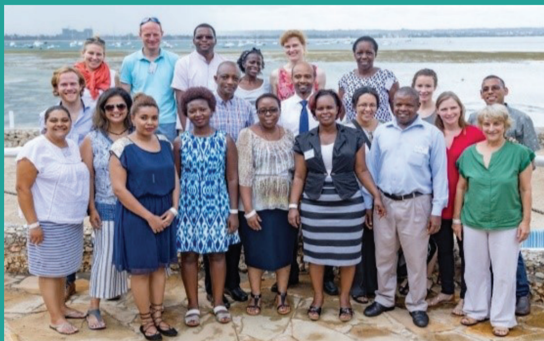
CEBHA+ Participants during the launch in 2017 in Oyster Bay, Dar-es-Salaam, Tanzania

CEBHA+ was officially launched in February 2017. This was during the Research Networks for Health Innovations in Sub-Saharan Africa kick-off meeting organised by BMBF on 14th to 15th February 2017 in Oyster Bay, Dar-es-Salaam, Tanzania. The project partners, experts, political/policy decision-makers from the five African-German networks came together and discussed in-depth the prospects of the BMBF initiative. The team discussed how to: strengthen the networks, synergies between networks and translation of research results into policy and practice. The CEBHA+ administrators, coordinators and finance persons received training on BMBF funding regulations and reporting.