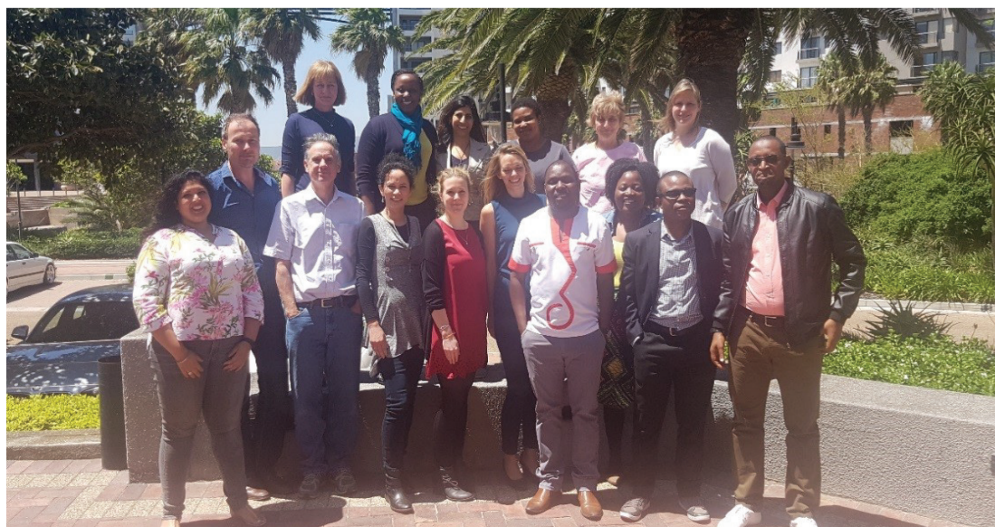
CEBHA+ members at network's IKT workshop in Cape Town, November 2018

In South Africa, Stellenbosch University (SU), Cochrane South Africa (CSA) (South African Medical Research Council (SAMRC)), and the Chronic Disease Initiative in Africa (CDIA) are involved in research tasks 1, 2 and 3. While SU and CSA are mainly involved in evidence syntheses and in providing methodological support across CEBHA+, CDIA leads the primary research. Through regular consultations with key stakeholders the three partners work together to promote the uptake of evidence into policy and practice.