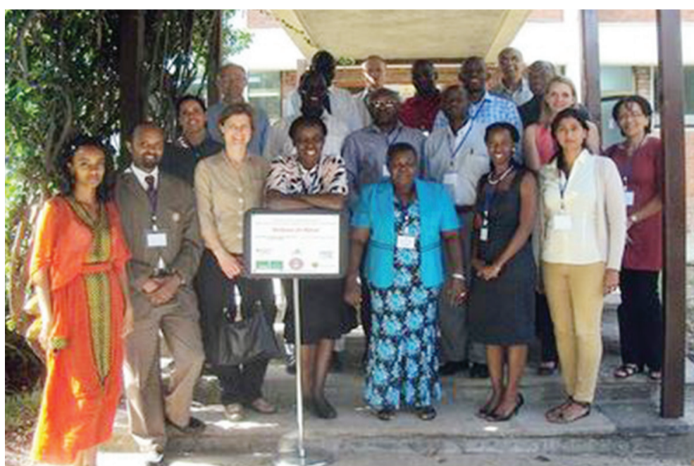
Team of researchers and decision-makers in Addis Ababa, April 2014, for the first CEBHA+ planning meeting.

The Collaboration for Evidence-Based Healthcare and Public Health in Africa (CEBHA+) represents one of five African-German "Research Networks for Health Innovations in Sub-Saharan Africa" funded by the German Federal Ministry of Education and Research (BMBF). As an overarching goal, CEBHA+ aims to build long-term capacity and infrastructure for Evidence-Based Healthcare and Public Health (EBPH) in Sub-Saharan Africa, notably in Ethiopia (AHRI), Malawi (University of Malawi), Rwanda (University of Rwanda), South Africa (Stellenbosch University, Cochrane South Africa, Chronic Disease Initiative for Africa) and Uganda (Makerere University). These countries work in collaboration with two CEBHA+ Germany institutions (Ludwig-Maximilians-Universitat Munich and Cochrane Germany). We aim to accomplish the CEBHA+ goal of gathering evidence to inform policy and practice on strategies to decrease the society's impact of selected Non Communicable Diseases (NCDs). Our goal is to undertake research in areas of hypertension, diabetes and road traffic injuries. For more information visit www.cebha.plus .